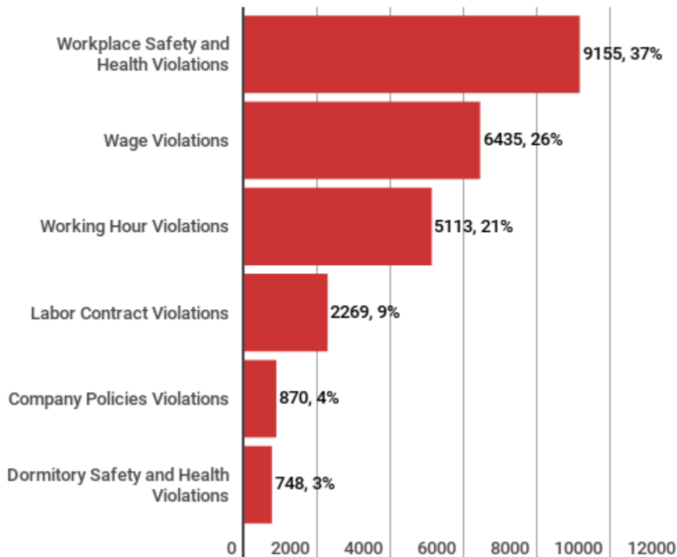
Chart 2: MHLW Inspection Data by Category of Violation, 2012-2016 25

Reported rates of death among TITP participants are high. At least 127 trainees died between 2005 and 2010, roughly one out of every 2,600 trainees. 25 The UN Human Rights Committee and the Labor Union of Migrant Workers has expressed concern over the high rate of death in a population that is generally healthy and relatively young. 26 JITCO has reported that the rate of deaths from heart disease among trainees is twice the rate for Japanese people in the same age group. 27 Since 2010, the government has classified two trainee deaths as cases of “ karoshi ,” death from overwork. 28 One of these victims had worked over 120 hours of overtime per month before dying of heart failure in his dorm. 29 On January 14, 2018, The Ministry of Health, Labor and Welfare issued the first official statistics on work-related deaths among foreign trainees in Japan: 22 foreign trainees were killed by work-related incidents over the three-year period from 2014 to 2016. The ratio of work-related deaths for foreign trainees per 100,000 was twice as high as the ratio for Japanese workers. 30